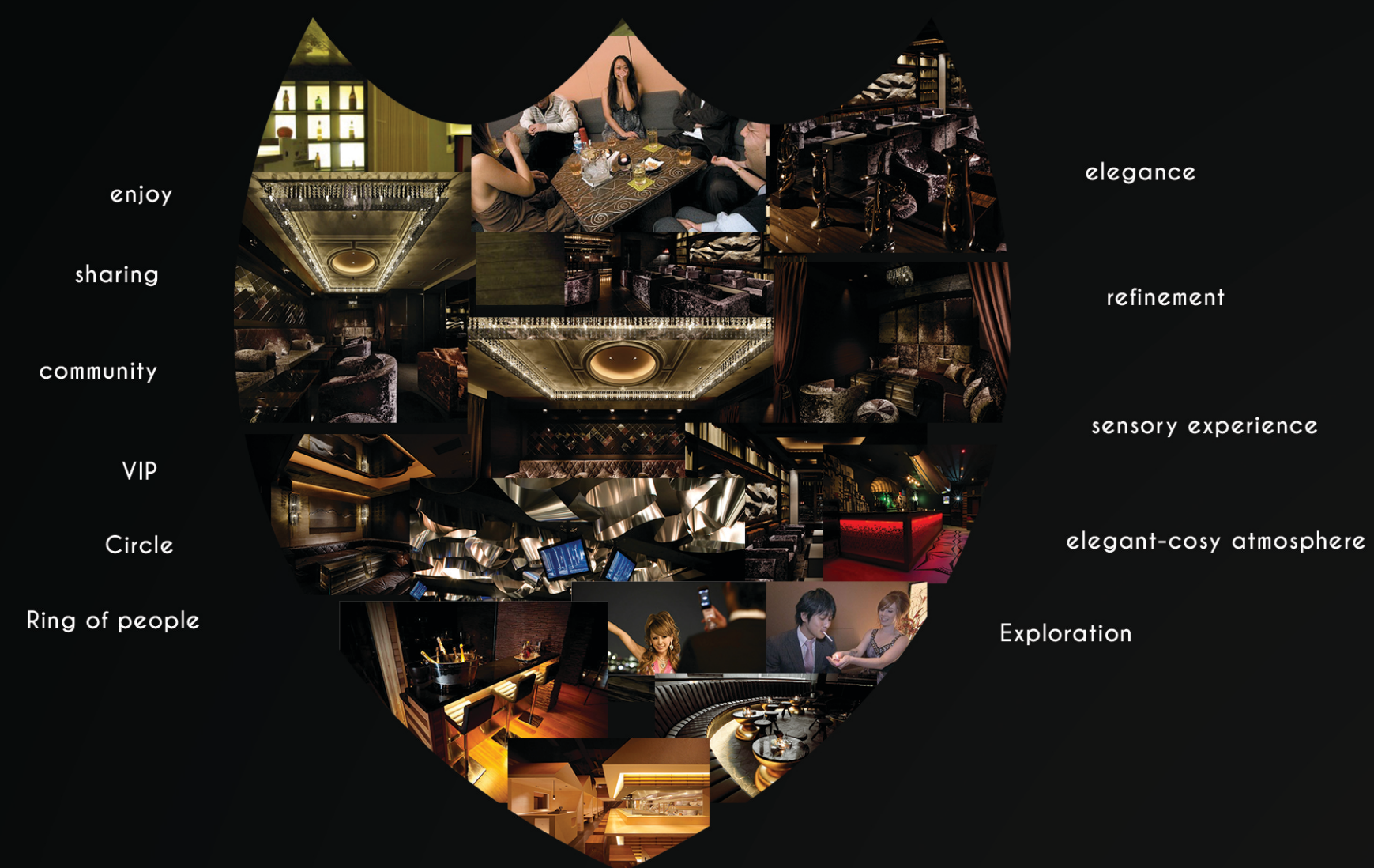
Hostess bar moodboard + Mindmap